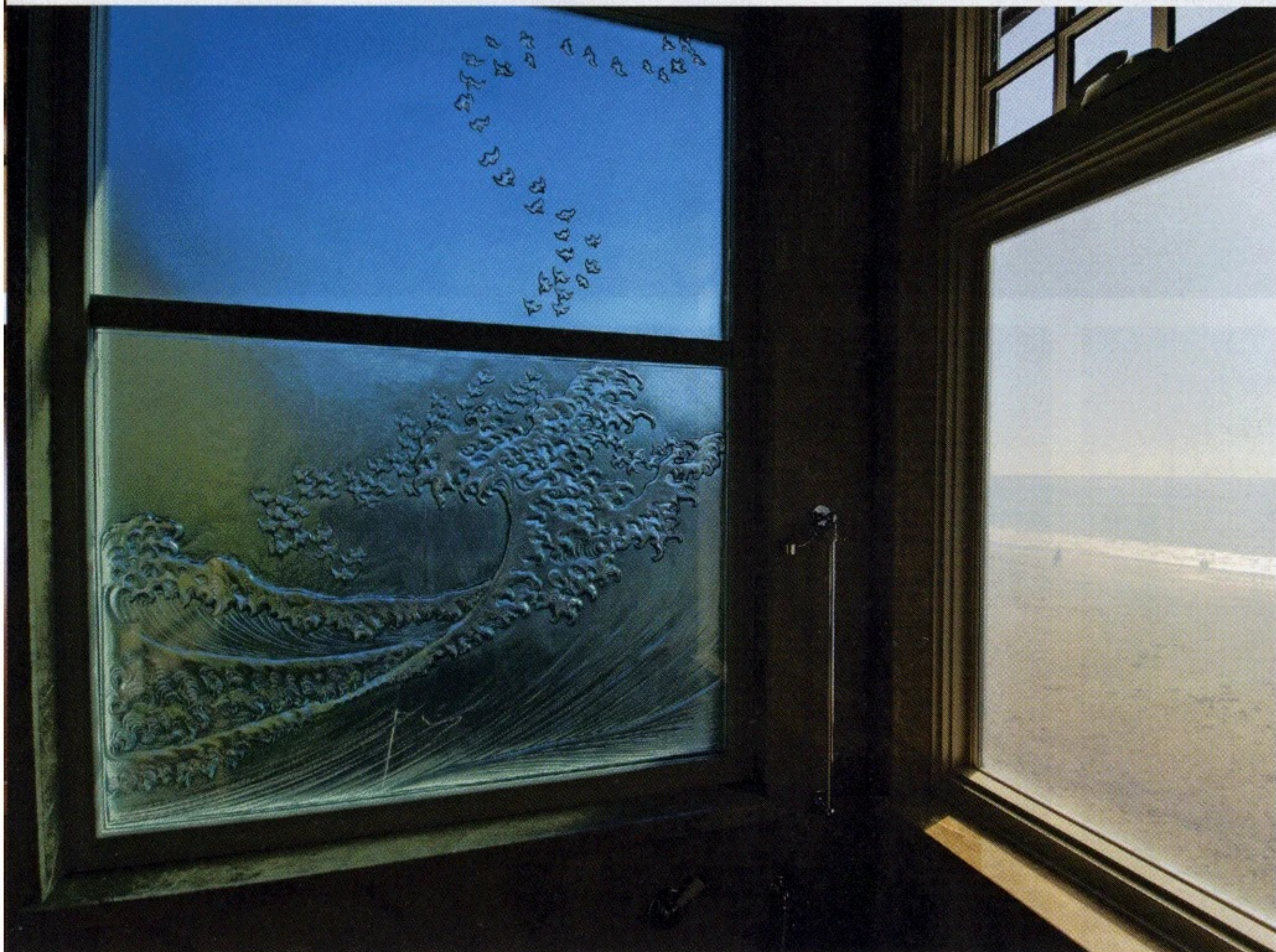
ABOVE Lucky guests can awaken and watch migrating whales from bed. LEFT One guest bath faces the beach; to guarantee privacy, the window is actually an LCD panel that becomes opaque at the touch of a button.